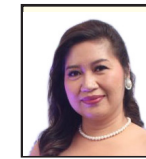
Soci Ame Patagani-Viking Community Service